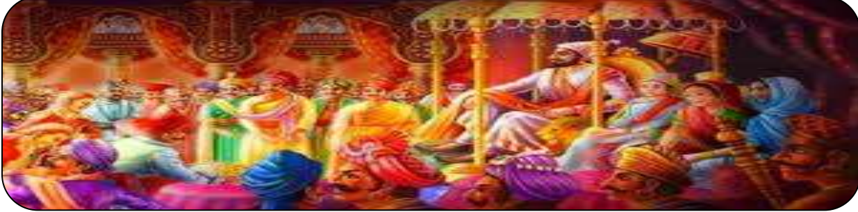
Coronation of Shivaji Maharaj